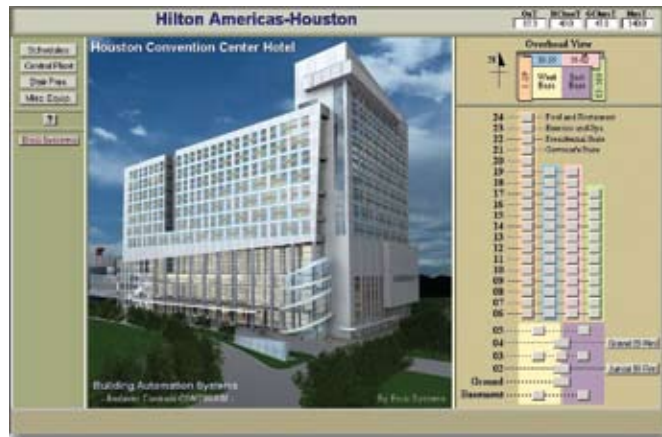
CyberStation workstation home screen

“Enco created a user-friendly graphical screen for us to schedule temperature and lighting for the hotel’s meeting rooms each morning. CyberStation also provides my staff with real-time information on each space in the hotel and the equipment that services it. Alarms are routed both to the workstation and our Nextel phones, so we can take the appropriate action quickly. We are still fine-tuning the system, but already I feel like we have unlimited capabilities!”