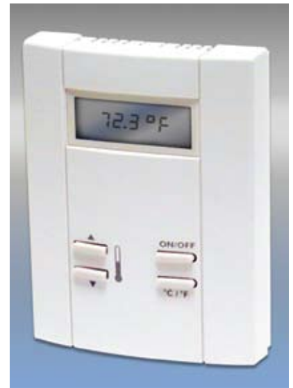
Andover Smart Sensor

If the room’s motion sensor does not detect movement within 30 minutes, the room will go back to a “Rented, Unoccupied” mode. This would occur if the occupant left his room temporarily. This control sequence is overridden between 12 midnight and 5am, when the system assumes that a lack of motion coincides with the occupant sleeping and maintains the room in a “Rented, Occupied” mode.